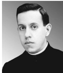
ST. JUAN DIEGO