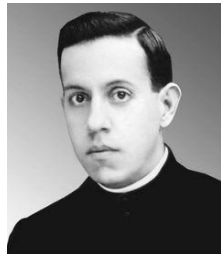
ST. JUAN DIEGO