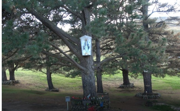
At The Pines

* Purchase : Pay in advance (2 persons) 3-night stay for $500. Credit cards accepted or checks payable to: “Building a House for Mary, Inc.”