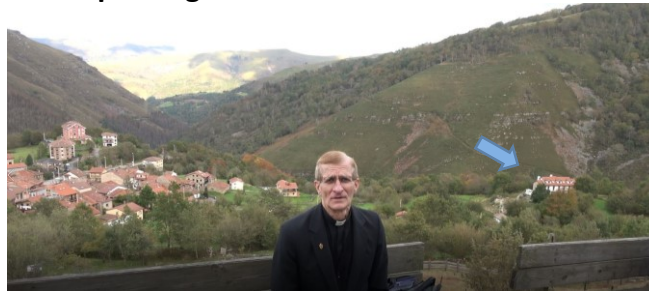
Above: View of "Mary's House" from the Pines Below: Completion of Phase II

We believe a "House for Mary" in Garabandal will help change the world for the better!